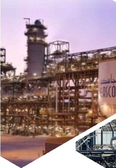
Shutdowns At ADNOC Gas Processing Plants, Ruwais