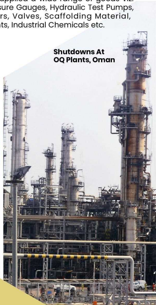
Shutdowns At OQ Plants, Oman