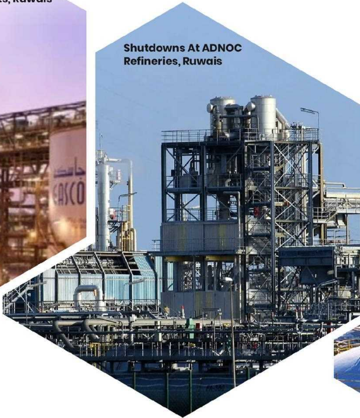
Shutdowns At ADNOC Refineries, Ruwais