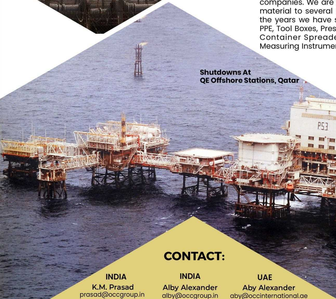
Shutdowns At QE Offshore Stations, Qatar

Export of Engineering goods mainly used by Oil & Gas companies. We are regular suppliers of PPE and related material to several companies in the Middle East. Over the years we have supplied a wide range of goods viz. PPE, Tool Boxes, Pressure Gauges, Hydraulic Test Pumps, Container Spreaders, Valves, Scaffolding Material, Measuring Instruments, Industrial Chemicals etc.